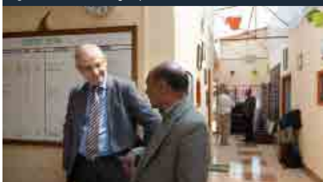
Figure 1: Inside the existing hospice in Kathmandu

of Health Sciences (Figure 1). There is presently an 8 bed in-patient unit, a home based community programme in Kathmandu and a rural programme in the Makwanpur area (Table 3).