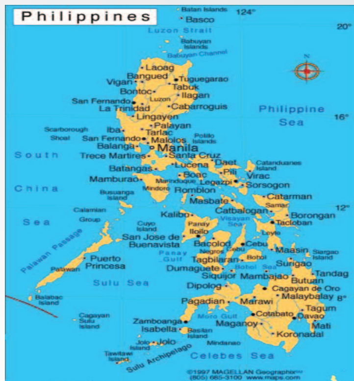
Figure 1: Location of hospitals in the Philippine Childhood Cancer Network

campaign. As a result, late stage diagnosis decreased to 30% from 70% when patients are seen for the first time in these hospitals.