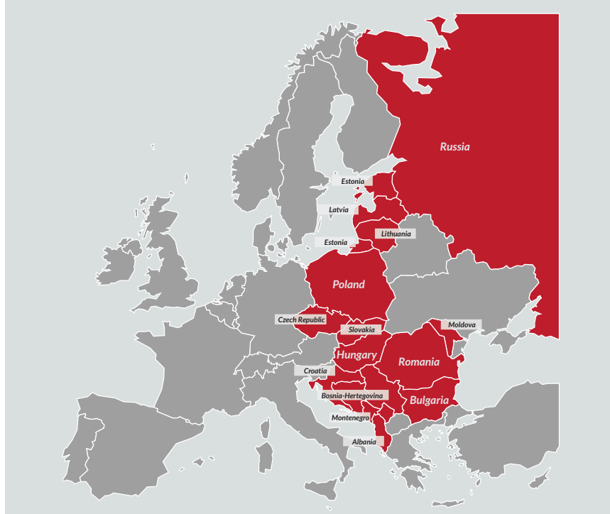
Figure 2: Countries in Central and Eastern Europe in which ESO has carried out training activities

access to medical journals and even textbooks constitutes a problem in some CEE countries.