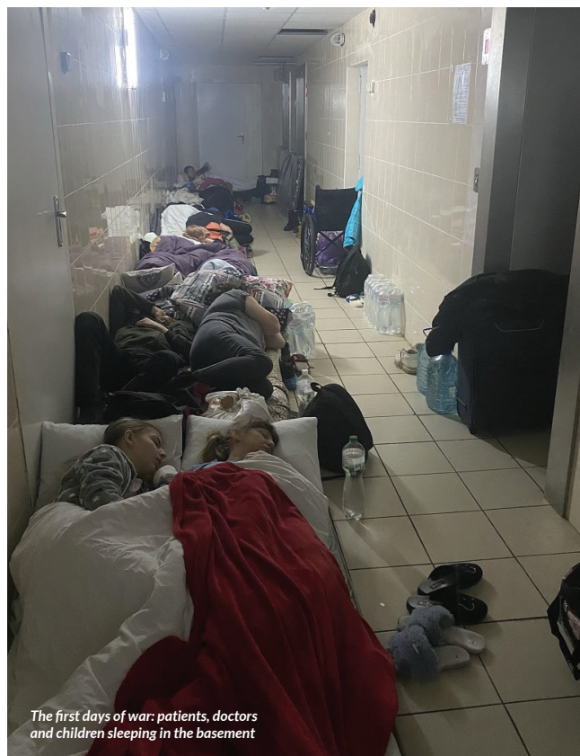
The first days of war: patients, doctors and children sleeping in the basement

The Russian intrusion was totally underestimated. Nobody