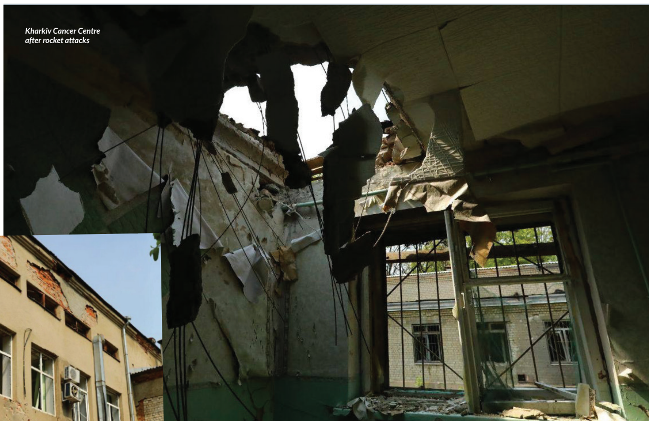
Kharkiv Cancer Centre after rocket attacks

months, when the Ministry of Health evaluated the pros and cons of granting permission to use linear accelerators for patient treatment. Such a step was mainly due to the overflow of patients in the western part of Ukraine and the long