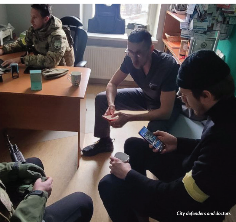
City defenders and doctors

and now your country is under attack. What do you do in such a situation? We were not trained for that in medical school; how to properly handle such stress and how to choose the right actions under such conditions. The rationale of ensuring your family was safe was very dominant for many oncologists and it took some time to organize an evacuation from the dangers of Kyiv City to western parts of Ukraine.